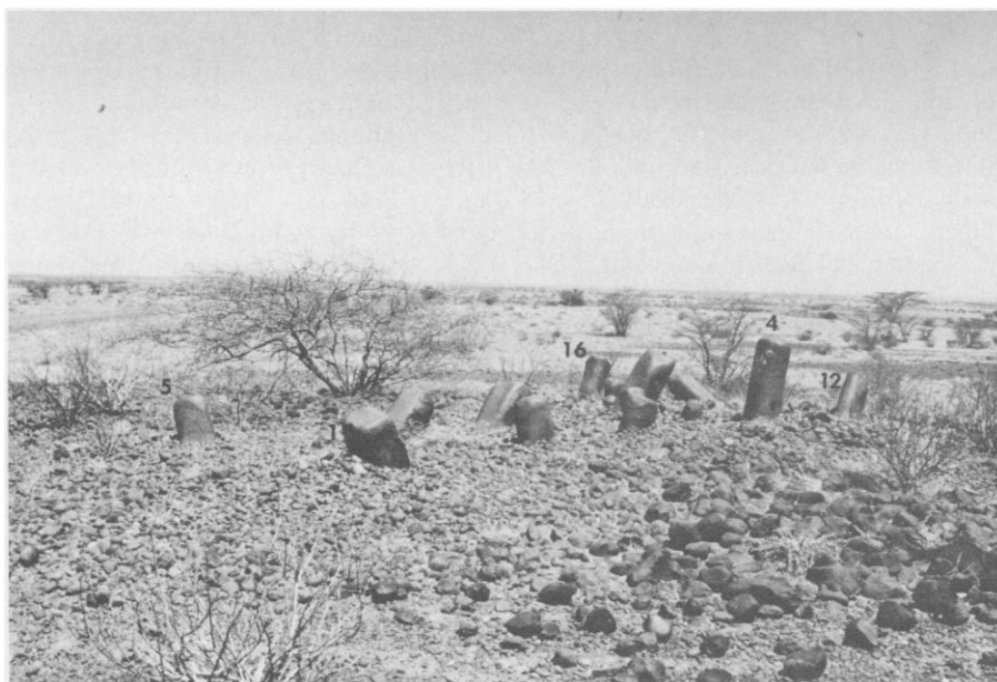
Fig. 2. Pattern of stones at Namoratunga II.

Department of Anthropology, Michigan State University, East Lansing 48824